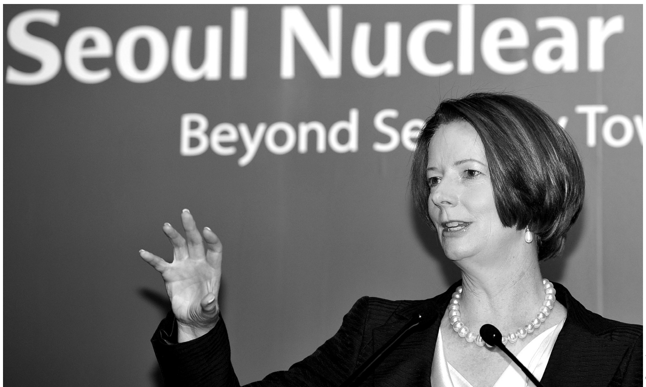
Australia's Prime Minister Julia Gillard speaks during a press conference at the end of the 2012 Seoul Nuclear Security Summit on March 27, 2012. Australia ratified ICSANT in March 2012.

Azerbaijan is strengthening its export controls to combat illicit trafficking. Brazil is revising its domestic laws and developing new rules on the physical protection of radioactive materials. Chile has drafted updated national regulatory instruments, including a proposal for establishing an independent regulatory authority, and it is concluding an administrative agreement to import and export radioactive material under the IAEA Code of Conduct. Indonesia is