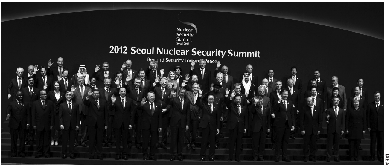
Leaders from 53 countries gathered in Seoul on March 26-27, 2012, for the second Nuclear Security Summit. Since the first summit was held in Washington, D.C. in April 2010, countries have made significant progress strengthening global nuclear security. A third summit will be held in the Netherlands in 2014.

norms. Also included in this section are efforts to update countries' Design Basis Threat models and improve law enforcement and emergency response strategies.