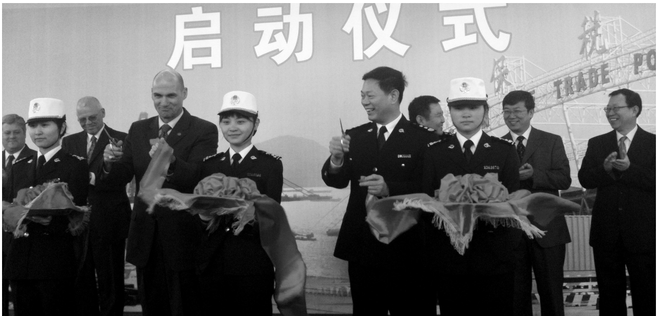
U.S. and Chinese officials cut a ribbon on December 7, 2011, to mark the commissioning of the Yangshan Megaports Initiative. In 2012, new Megaports became operational in Argentina and Vietnam.