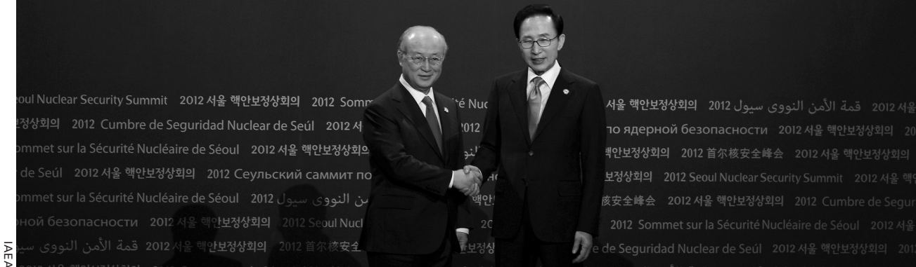
Lee Myung-bak, right, president of the Republic of Korea, welcomes IAEA Director General Yukiya Amano to Seoul for the 2012 Nuclear Security Summit on March 26. The IAEA plays a critical role in nuclear security.