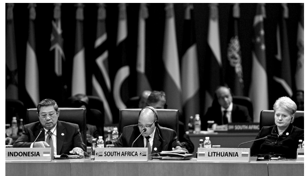
Indonesia's President Susilo Bambang Yudhoyono, left, South Africa's President Jacob Zuma, and Lithuania's President Dalia Grybauskaitė attend the first plenary session of the 2012 Nuclear Security Summit in Seoul on March 27.

For the purposes of organizing and presenting the material in this report, the actions listed in the progress reports were divided into four categories: